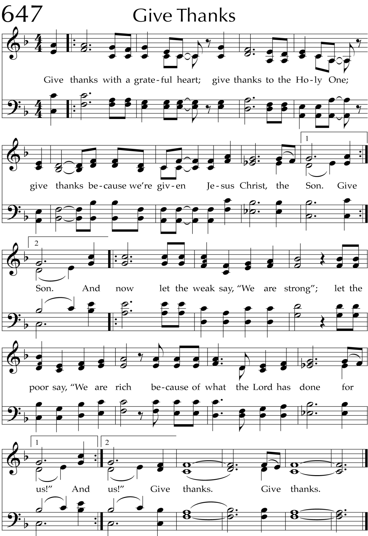
Drawing on language from 2 Corinthians 6:10 and 12:10 as well as Psalm 126:3, this short and repetitive song can be easily memorized. The simple vocabulary makes it suitable for multigenerational use, reminding all ages how gratitude for God's goodness changes our perspective.