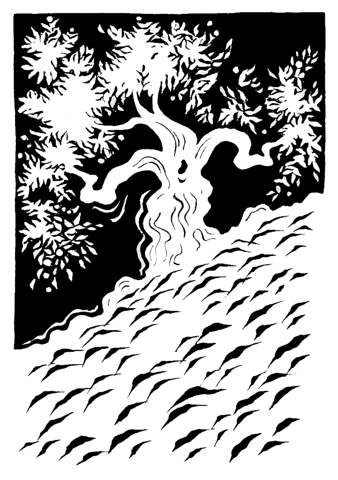
WALLINGFORD PRESBYTERIAN CHURCH JANUARY 14TH, 2024 2ND SUNDAY AFTER EPIPHANY