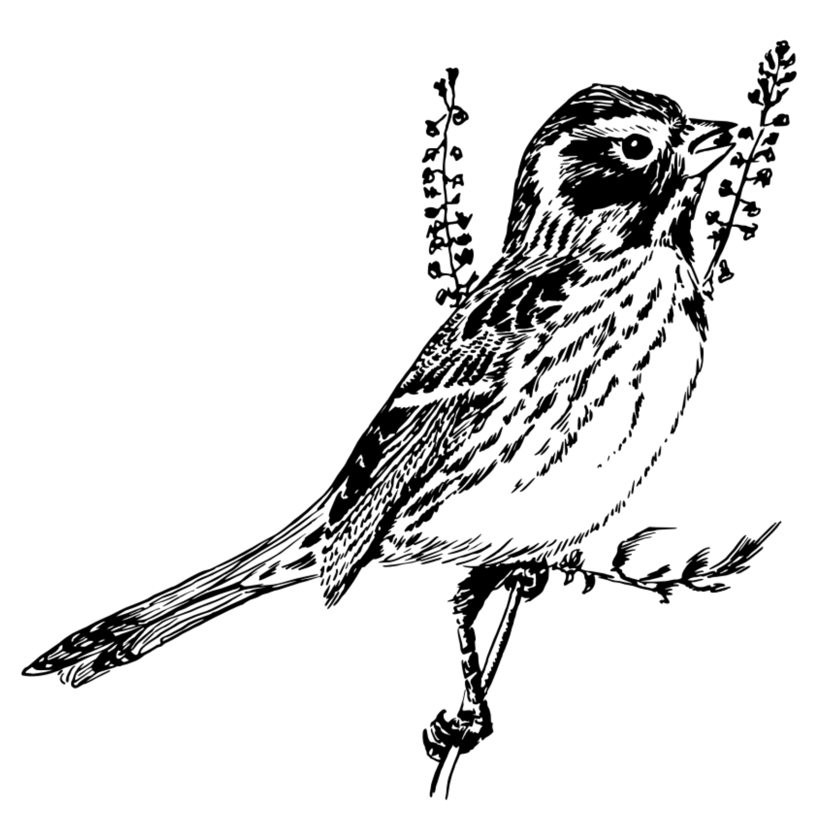
WALLINGFORD PRESBYTERIAN CHURCH FOURTH SUNDAY AFTER PENTECOST JUNE 25, 2023