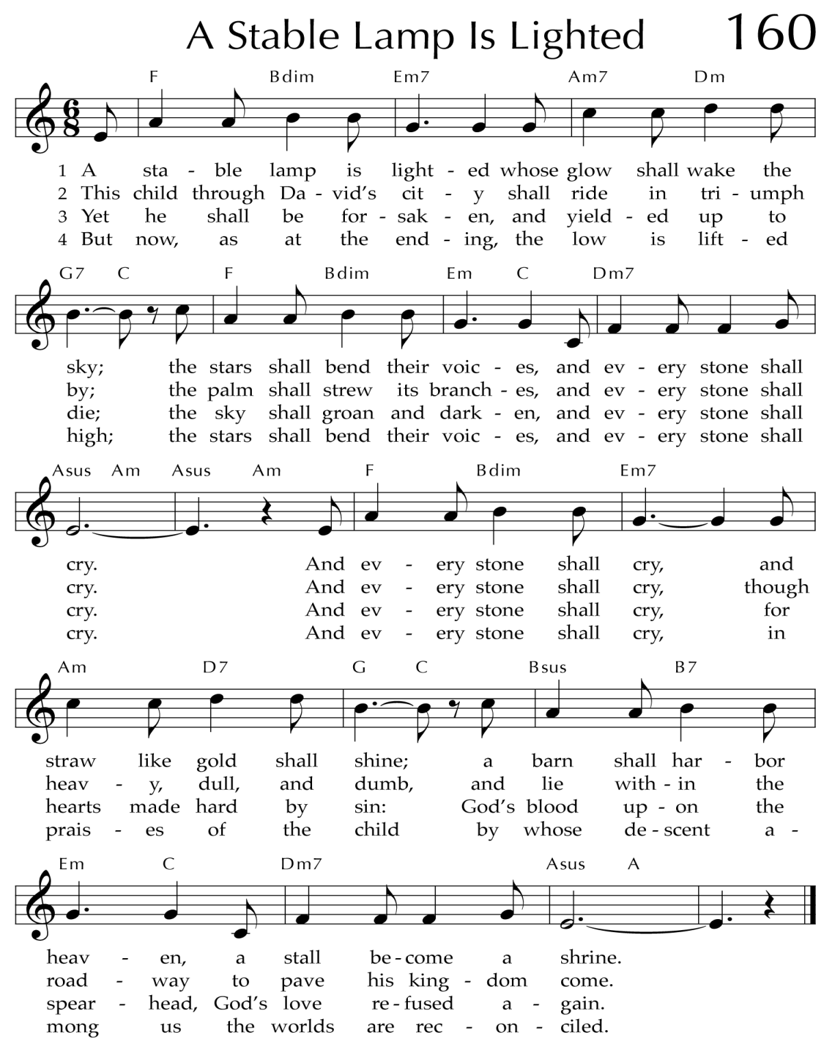
Guitar chords do not correspond with keyboard harmony.

The doubled lines in each stanza of this reflection on Christ's birth and death echo his saying (Luke 19:40) that creation will praise him if people are silent. This text by a former Poet Laureate of the United States is set to a lullaby-like tune specially composed for it.