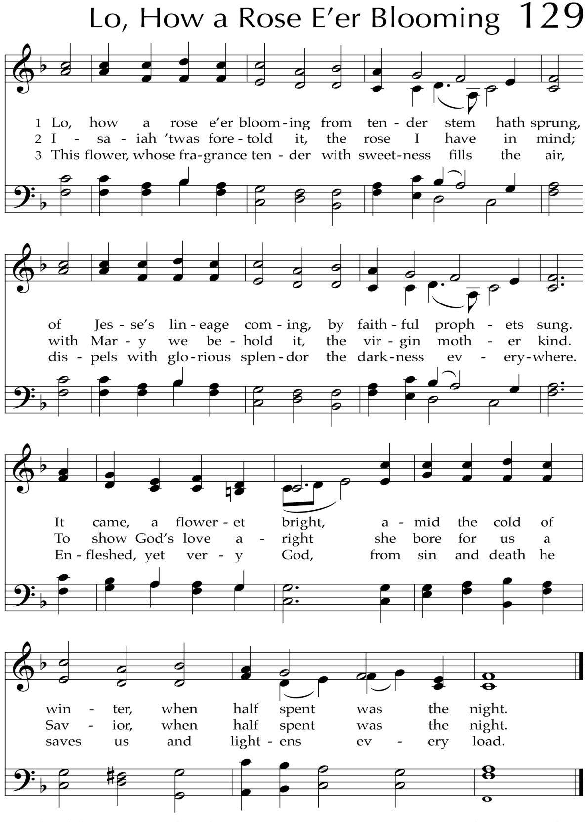
JESUS CHRIST: BIRTH

Although the early copies of this 15th-century German text include many more stanzas than are printed here, this simpler, shorter form has much to commend it. This early 17th-century harmonization of the traditional chorale melody invites and rewards singing in parts.